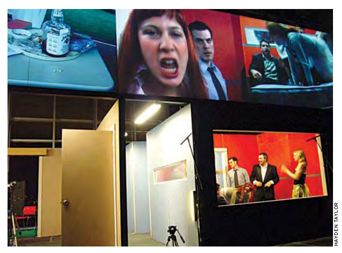
This Place Is a Desert at Boston's Institute of Contemporary Art.

If my research has to do with the integration of media and live performance, or development of tech for use in live performance, or exploring other theatrical idioms, I have to theorize them and describe them in concrete ways." He can also use student productions to begin explorations—he had his first crack at the Mars project at MIT in October, for instance. "So long as I can continue to main-